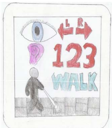
Picture of the runner-up poster / logo by Maya Kishigbat (Aged 13) in the 12-16 age category of the Mobility21 web logo competition, 2007.