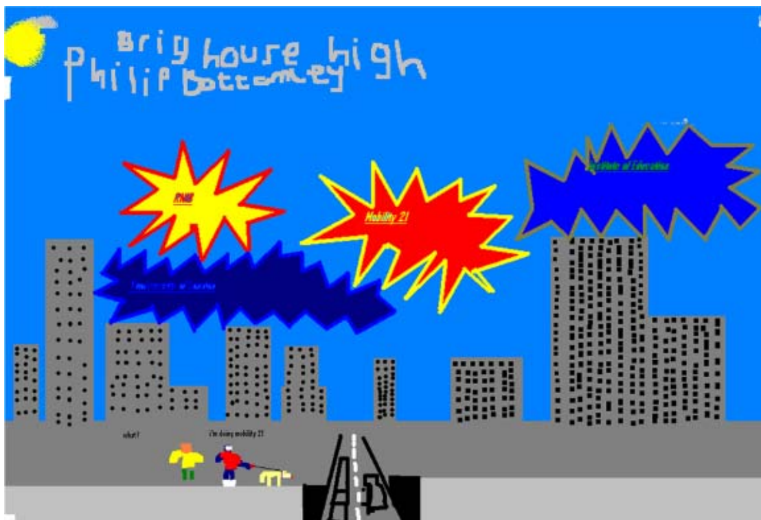
Picture of the runner-up poster / logo by Philip Bottomley (Aged 15) in the 12-16 age category of the Mobility21 web logo competition, 2007

Next monthly update available for addition to this briefing pack: March 31 st 2008.